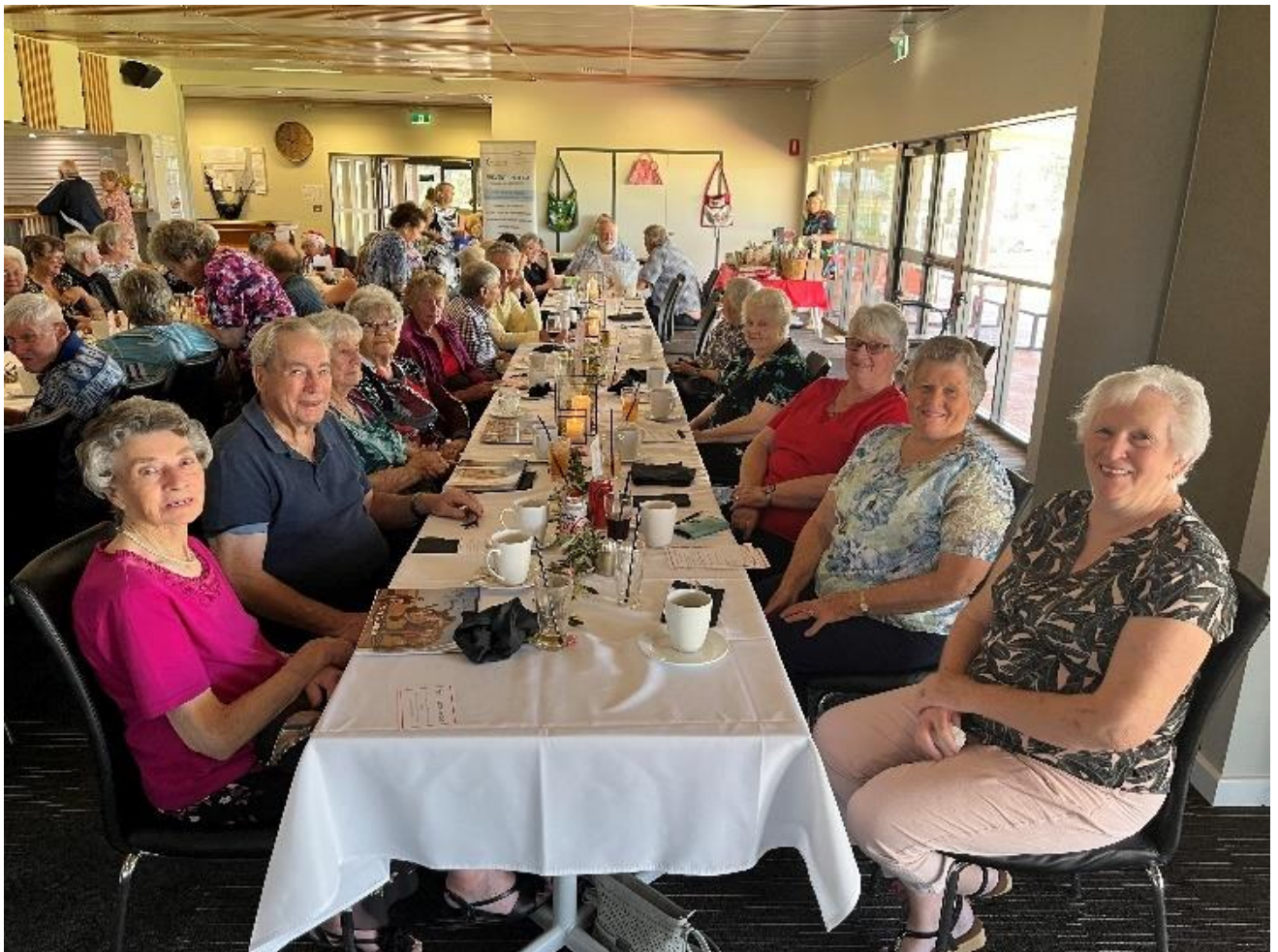
Seniors Luncheon 2022