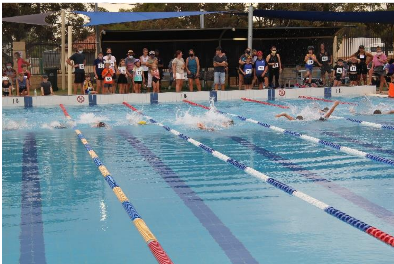
Narembeen Triathlon 2022

The triathlon marks another important and popular event for the community. After feedback from many community members the Narembeen CRC allowed little athletes to participate in this year's triathlon. This was a huge success and many children competed.